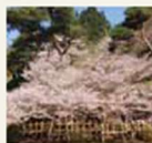
Mamezakura Late April Cerasus incisa var. incisa