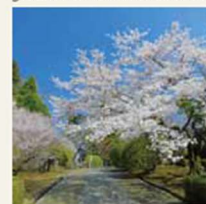
Ruins of Sanjo Gate and Cherry Blossoms in Bloom (Spring)

The changes of the seasons are revealed in Mt. Fuji reflected in the lake and the hedges, trees and groves from the time of Hakone Palace. You're sure to enjoy a walk around the grounds which takes about one hour.