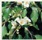
Himesyara Early July Stewartia monadelpha