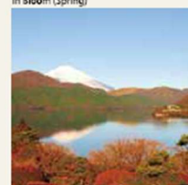
Fall Leaves and Mt. Fuji (Autumn)