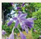
Giboshi Late July through Early August Hosta cv.