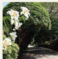
Central Promenade and Yamayuri (Summer)