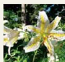
Yamayuri Late July through Early August Lilium auratum