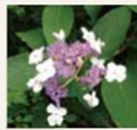
Tamaajisai July Hydrangea involucrata