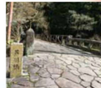
Ashikawa-bashi (Bridge) (One of the 100 bridges of Kanagawa)