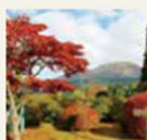
Momiji November Acer sp.