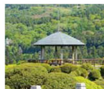
Benten-no-hana Tenboudai (Viewing Platform)

A two floor example of European architecture built from hewn white granite based on the motif of the Occidental Hall of Hakone Palace. Inside there are exhibition spaces with collections of Hakone Palace documents and a rest area. From the balcony on the second floor you can enjoy a view like no other.