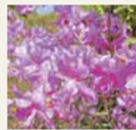
Mitsuhashitsutsu Late April through Early May Rhododendron dilatatum