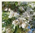
Asebi Late March Pieris japonica