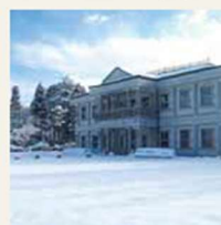
Lakeside Panorama Hall on a snowy day (Winter)