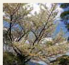
Oshimazakura Late April through Early May Cerasus speciosa