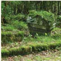
Old Sanjo Gate Pillar Capitals