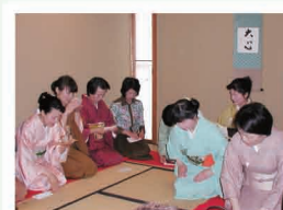
Tea room Jozan-an

Aside from being available for use for tea ceremonies, tea ceremony classes that teach the basic etiquette of tea ceremonies are also held with advance reservations. In the adjacent rest area, you can also enjoy matcha (green tea) and seasonal wagashi (Japanese confectionery).